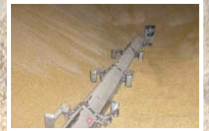
Design allows Sweep to follow contour of floor.