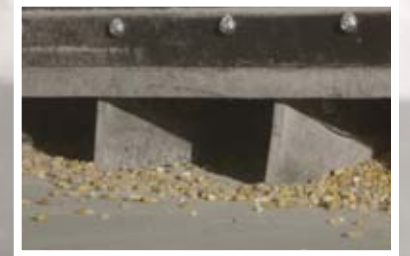
Moves grain gently and evenly to sump with flexible rubber paddles.