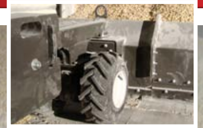
Tires are foam filled, with a tractor tread. Drive tire size is 13 x 5.00-6 Super Lug.